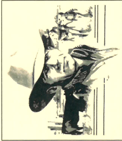
Cattlemen Working Together for the Future

Bonner-Boundary Cattle Association Sandpoint, ID 83864